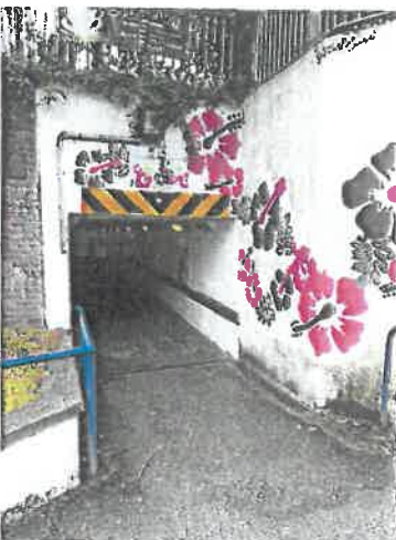
John Street entrance