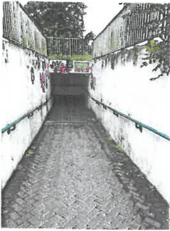
Station Hill Entrance